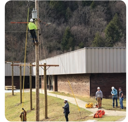
Power Linemen students are being instructed at their new outdoor classroom at MECC's Center for Workforce and Innovation of Appalachia

The Foundation plans to apply for additional grants to establish more academic and student support resources at the Center with plans to partner with the United Way of Southwest Virginia and Frontier Health.